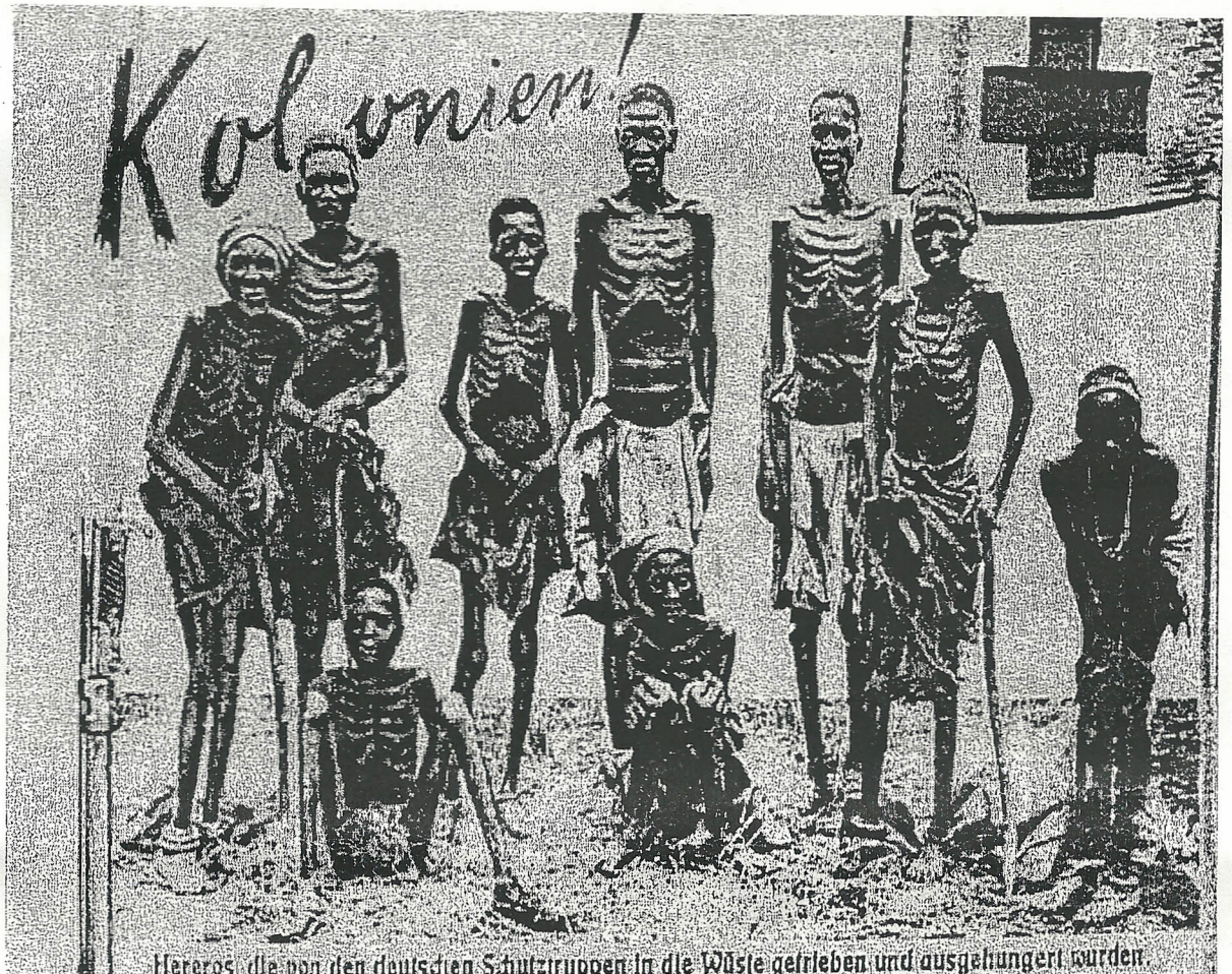
Hereros, die von den deutschen Schutztruppen in die Wüste getrieben und ausgehungert wurden